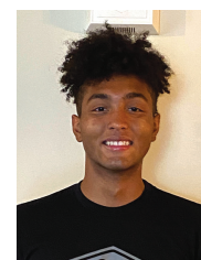
Ronald and Patricia Tweed Legacy Loan

Activities: Marching Band, Basketball, Concert Band, Jazz Band