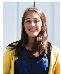
Frances Sarkisian Trust Legacy Loan