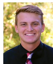
Catherine N. Witmer Memorial Legacy Loan