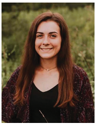
Pryor E. and Arlene R. Neuber Legacy Loan