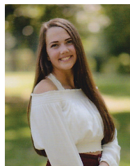
Allen Family Foundation Legacy Loan