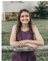
Pangburn Family Legacy Loan