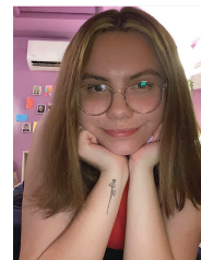
Margaret Gordon Lestz Legacy Loan