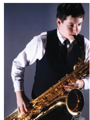
Gray Playter Memorial Legacy Loan