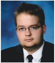
Richard A. Humphreville Memorial Legacy Loan