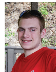
Dr. Lawrence A. Ezard Memorial Legacy Loan