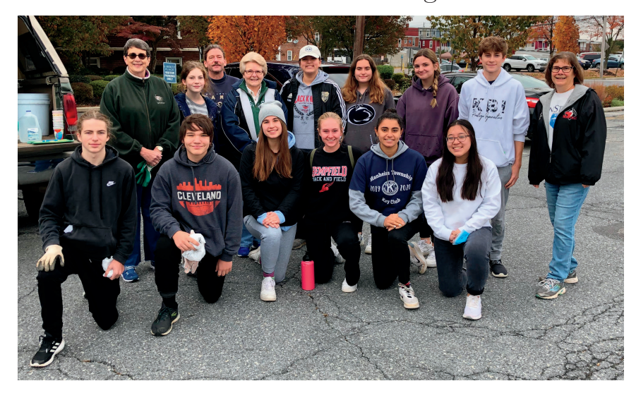
Board, staff and student volunteers participate in 2022 Adopt\hbox{-}A\hbox{-}Block

Since 2019, volunteers have donated 124 hours collecting 482 pounds of litter around the LDHL office neighborhood.